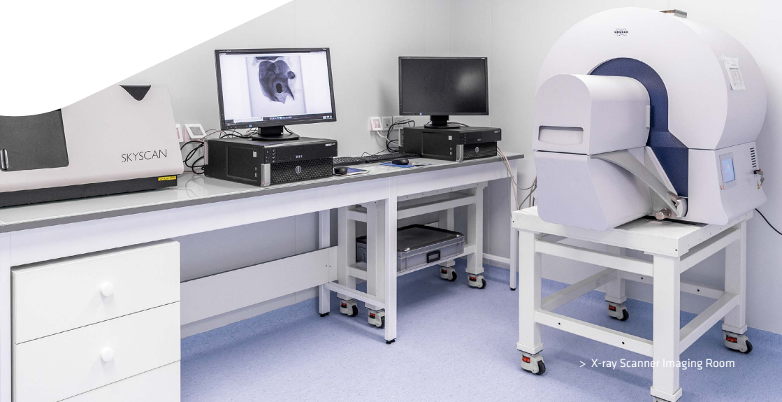
> X-ray Scanner Imaging Room